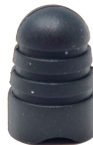
Distal Grip Band, Small DTLGSM