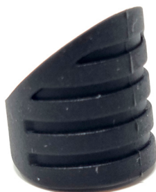
Grip Band, 66mm 066GB