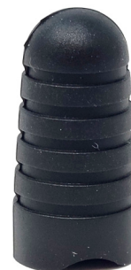
Distal Grip Band, Large DTLGBLG