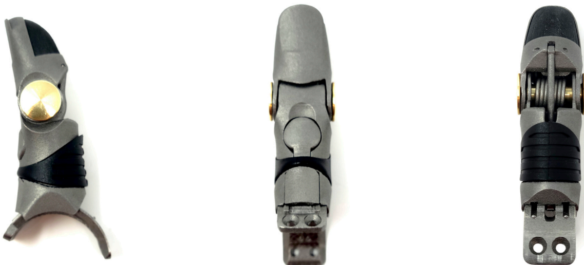
Fully installed Point Thumb Grip Band.