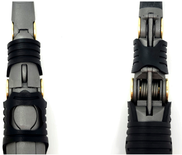
Medial Grip Band properly installed.