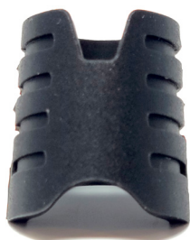
Medial Grip Band, Large MEDGBLG