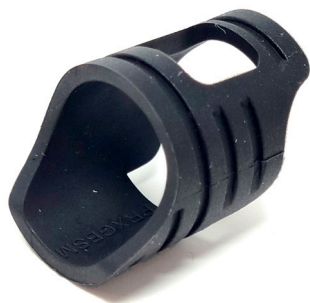
Proximal Grip Band, Small PRXGBSM