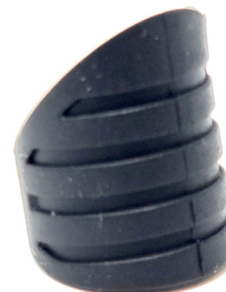
Grip Band, 73mm 073GB