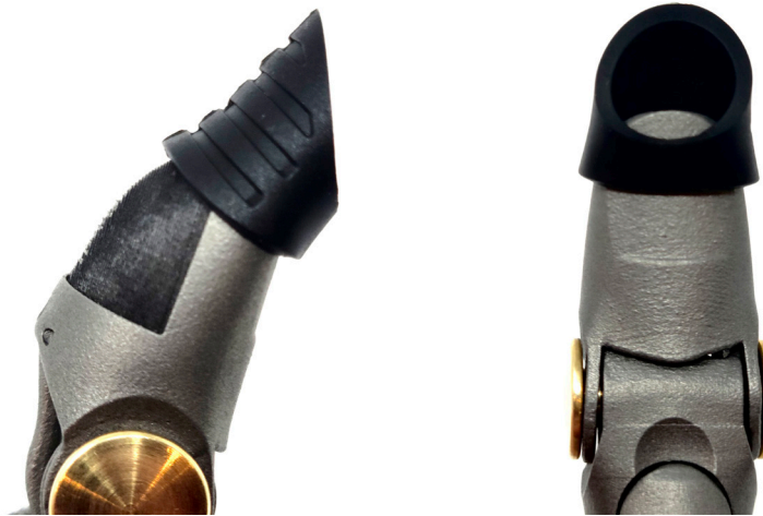
Proper orientation of the Point Thumb Grip Band.