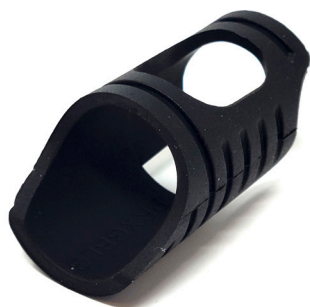
Proximal Grip Band, Large PRXGBLG