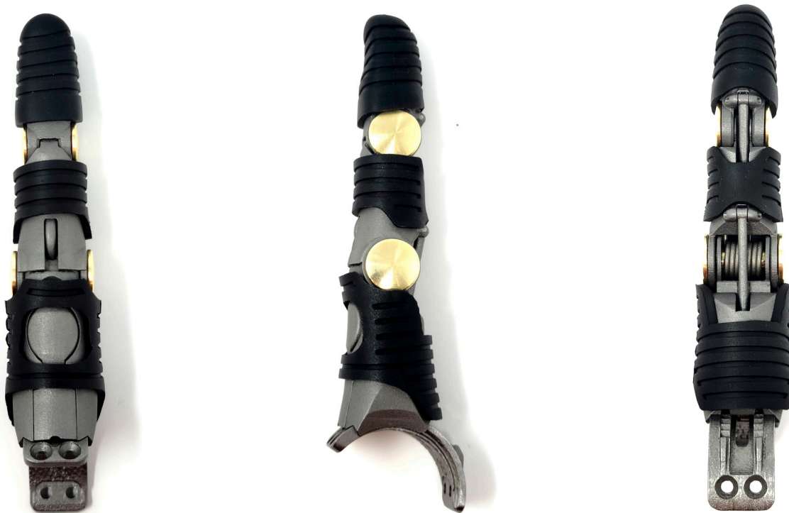
All Grip Bands fully installed.