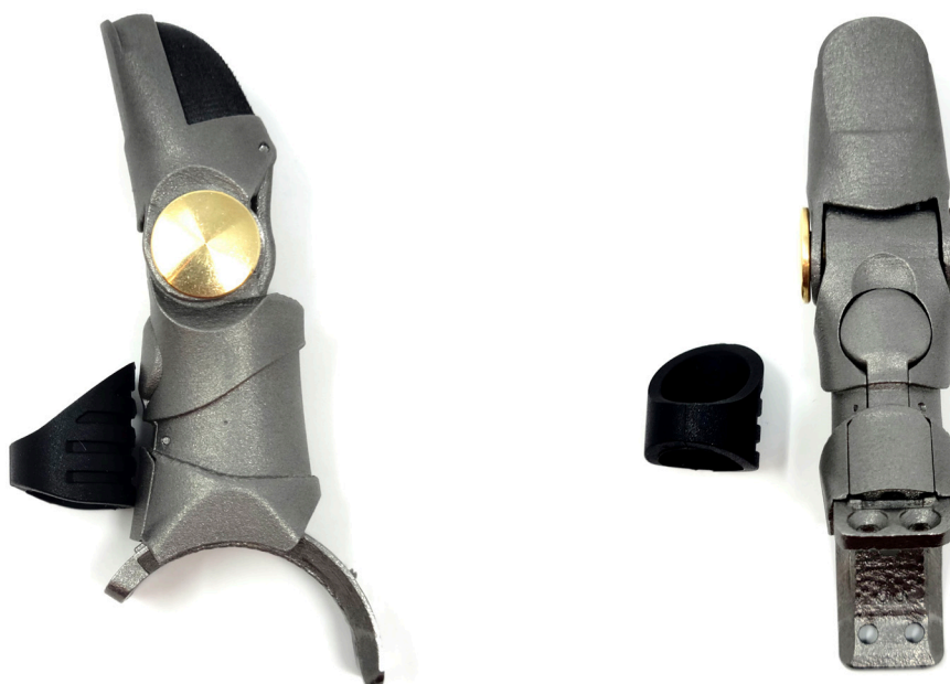
Proper orientation of the Point Thumb Grip Band.