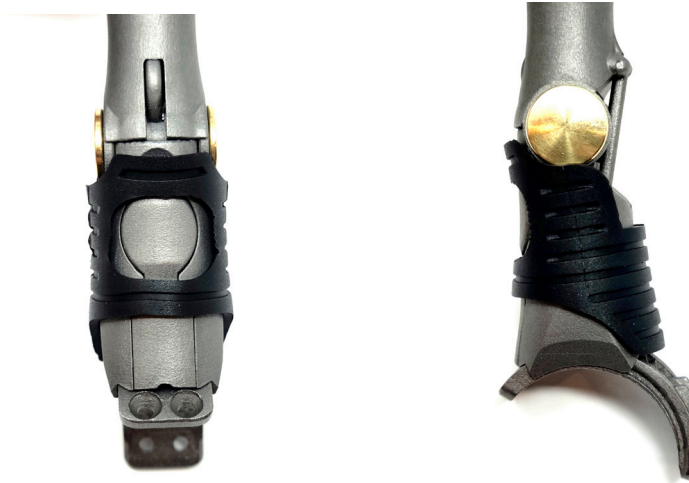
Proximal Grip Band properly installed.