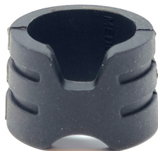
Medial Grip Band, Small MEDGBSM