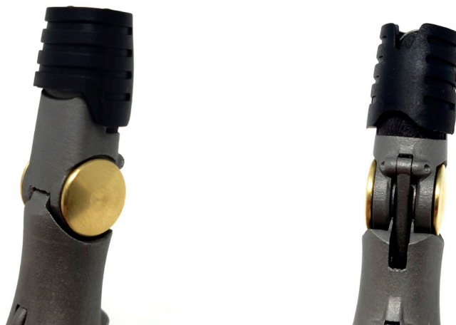
Proper orientation of the Medial Grip Band.