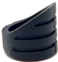
Grip Band, 59mm 059GB