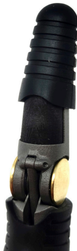
Proper orientation of the distal band.